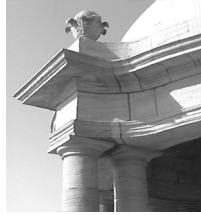
Jahangir Kothari Parade

Origins: The dome seems to have developed as roofing for circular mud-brick huts in ancient Mesopotamia about 6000 years ago. In the 14th century B.C. the Mycenaean Greeks built tombs roofed with steep corbeled domes in the shape of pointed beehives (tholos tombs). Otherwise, the dome was not important in ancient Greek architecture. The Romans developed the masonry dome in its purest form, culminating in a temple built by the emperor Hadrian. Set on a massive circular drum the coffered dome forms a perfect hemisphere on the interior, with a large oculus (eye) in its center to admit light.